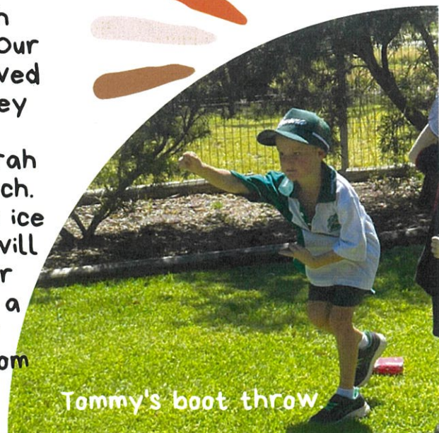
Tommy's boot throw

Everyone had a fantastic time at Bullarah Public School at our combined PDHPE day. There were loads of fun activities such as, three legged races, gumboot throwing, sack races, puzzles, tyre rolls and a very challenging commando course with water hazards and lots of climbing activities. Our students participated enthusiastically and showed excellent friendship and cooperation skills. They made friends with students from Bullarah, Mallowa and Bellatta Public School. The Bullarah P&C provided a delicious sausage sizzle for lunch. Our efforts on a hot day were rewarded with ice blocks before we left. Later in the year we will visit Mallowa PS and Bellatta PS for another combined fun day and of course we will host a day. This is a wonderful opportunity for our students to share and learn with students from other schools.