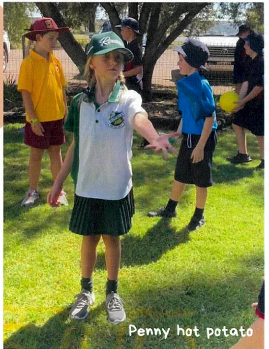
Penny hot potato