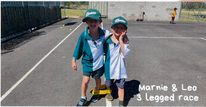
Marnie & Leo 3 legged race